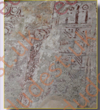
Wall Painting of Last Supper