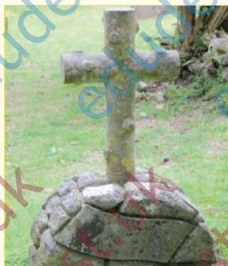
Cross made to look like wood