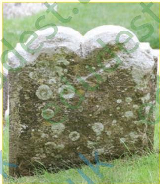
Tomb for a married couple