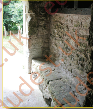
Seat for Sunday School