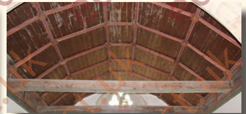
Cedar Roof from sunken ship