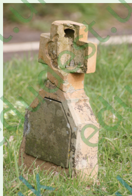
A pottery head stone