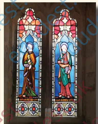
St Peter & St Paul Window