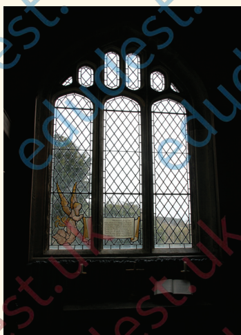
Plain Glass Window