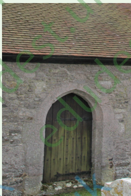
The North Door