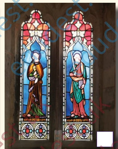
St Peter & St Paul Window