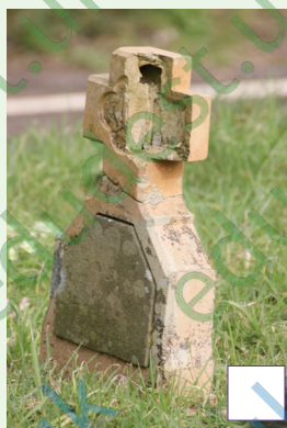
A pottery head stone