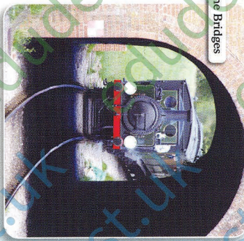
One of the Bridges