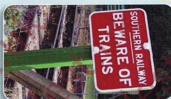
SOUTHERN RAILWAY BEWARE OF TRAINS