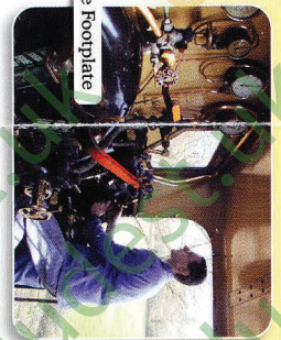
on the Footplate