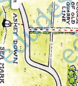
ASHLEY DOWN SEA MARK