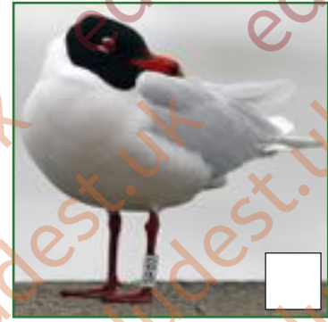
Mediterranean Gull (rare)