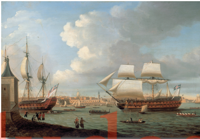
Foudroyant and Pégase entering Portsmouth Harbour, 1782 Dominic Serres

Label each image to pick out some of the key characteristics, and think about how it has changed- can you spot/discuss what some of the similarities and differences between then and now are?