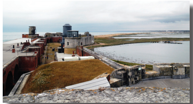
Hurst Castle, at the end of Hurst Spit