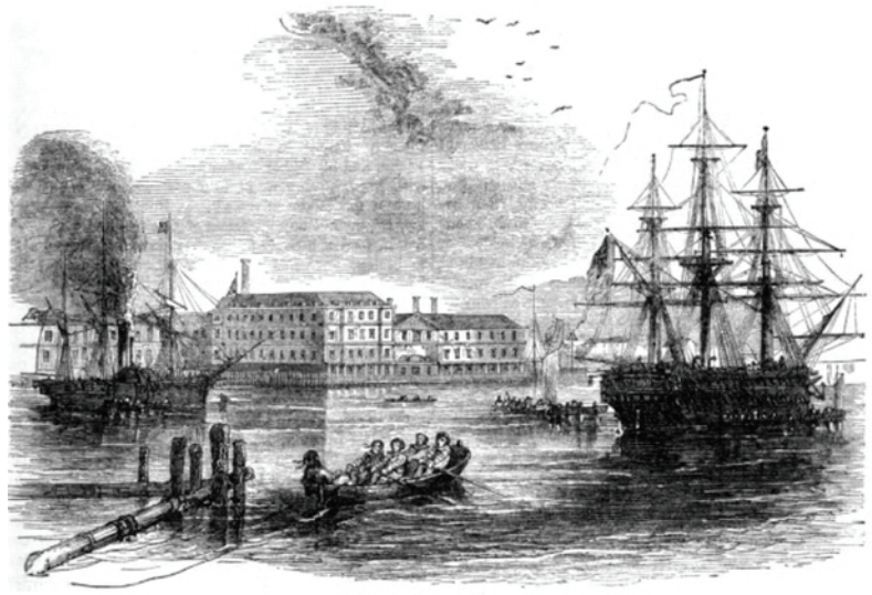
Portsmouth Harbour, 1865