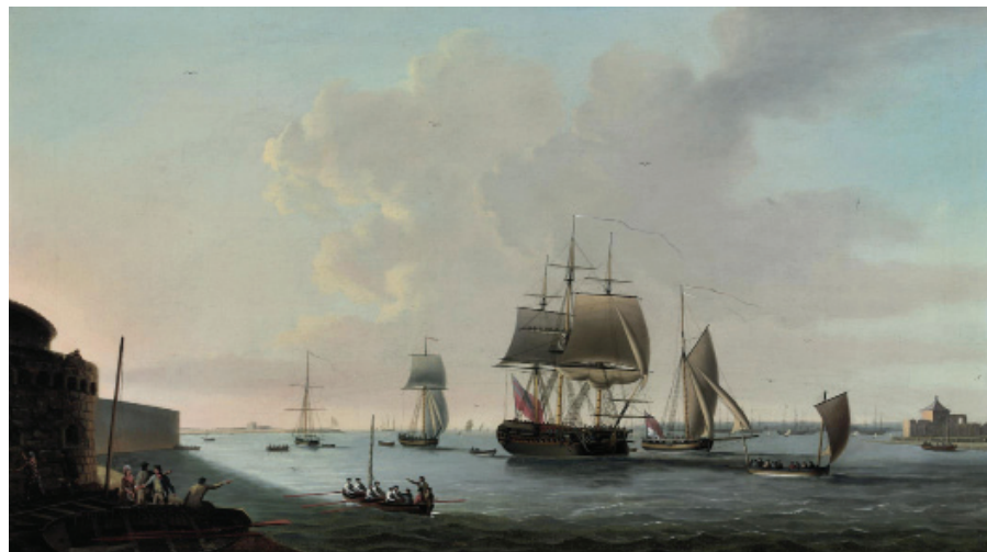
An English frigate running into Portsmouth harbour, with Fort Blockhouse off her port quarter, unknown date Dominic Serres